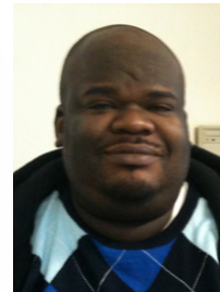
New face with YEP